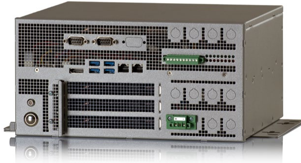
Figure shows configuration variant