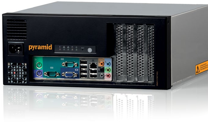
Figure shows configuration variant