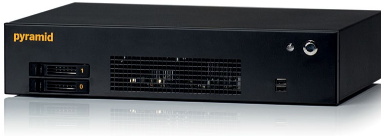
Figure shows configuration variant