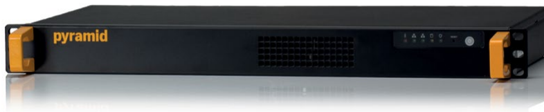
Figure shows configuration variant