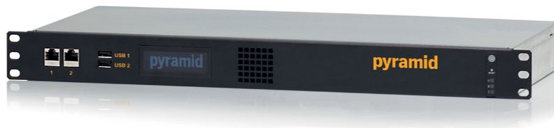
Figure shows configuration variant