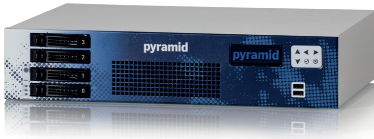
Figure shows configuration variant