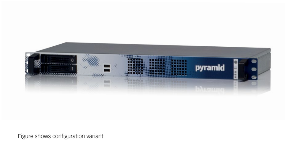
Figure shows configuration variant