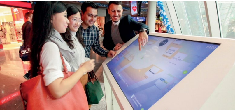
Quick & easy - personalized information at a glance