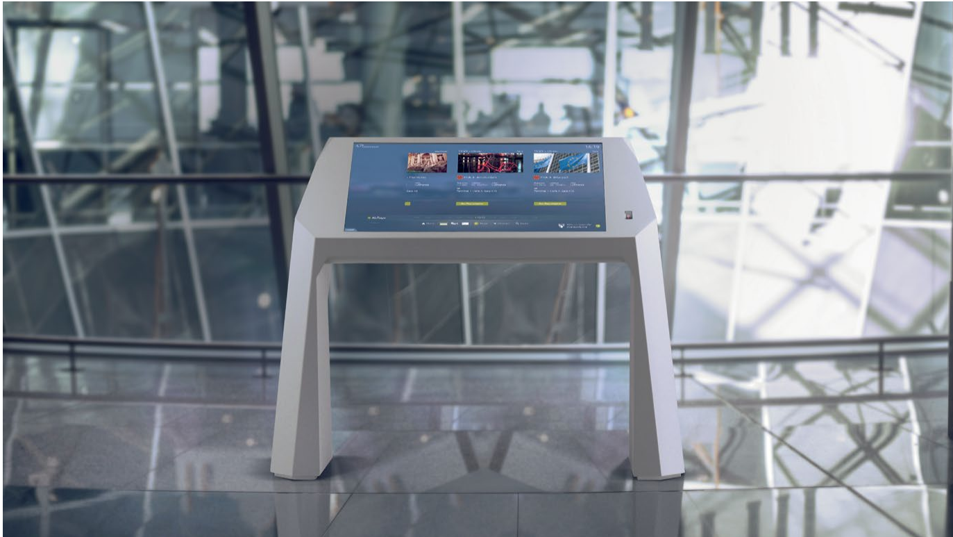
Way finding at Frankfurter Airport powered by polytouch®