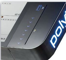
Magnetic card reader