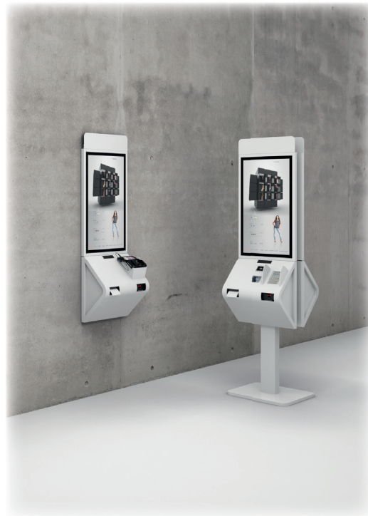
Figure shows configuration variant