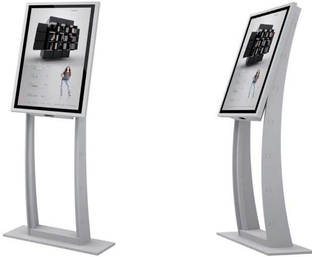
polytouch ® 32 portrait with pedestal wave