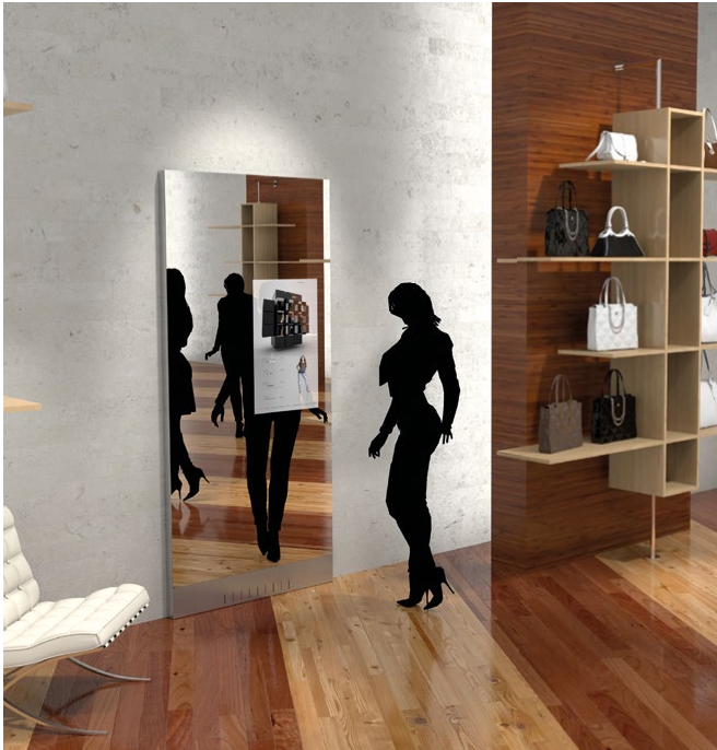
Figure shows configuration variant