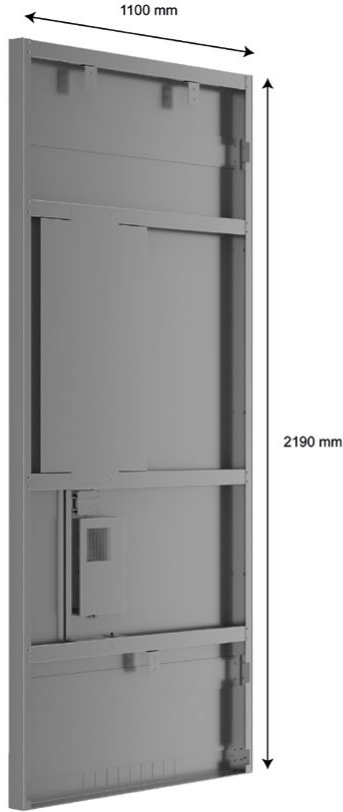
Figure shows configuration variant