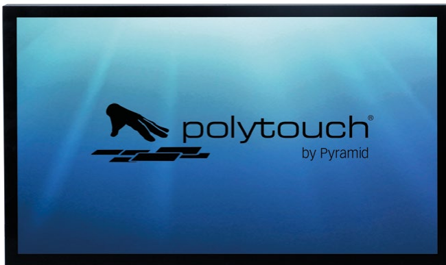
Figure shows configuration variant