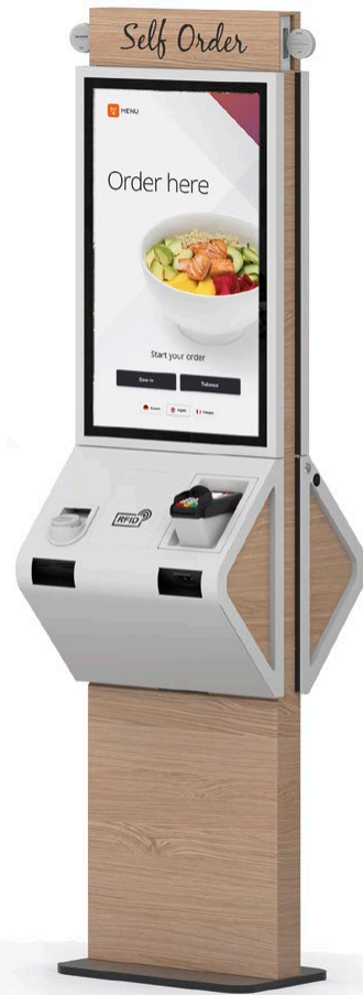
Kiosk order software by MENU Technologies

Pyramid polytouch® self-service terminals are perfectly built for a quick and convenient ordering and checkout process as well as for excellent cross and upselling opportunities, especially applications with high frequency usage and for restaurant automation.