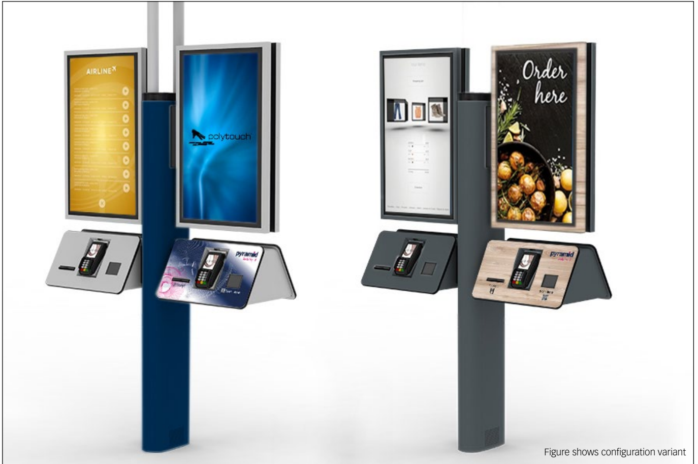
Figure shows configuration variant