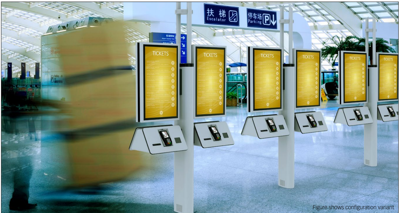
Figure shows configuration variant

4010062485_ds_polytouch_32_PE4000_EN_rel_0.3 · 07.08.19 · specification is subject to change