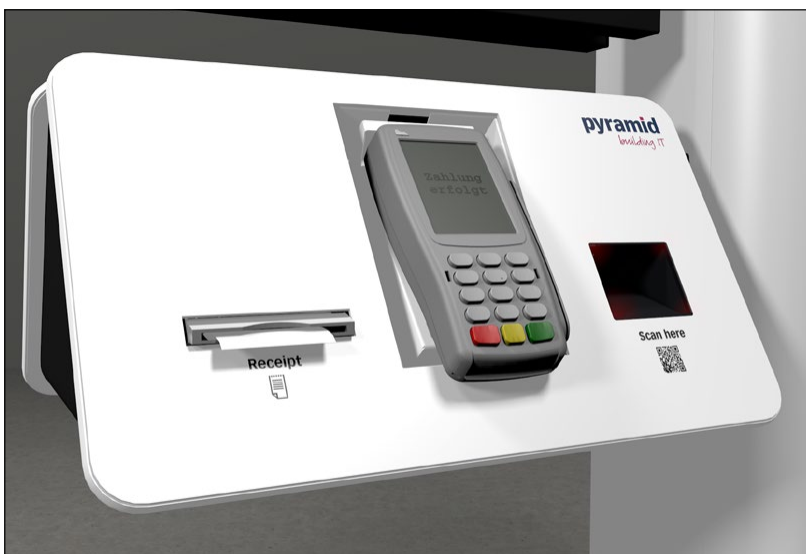
Customized front bezel with printer, payment module and scanner