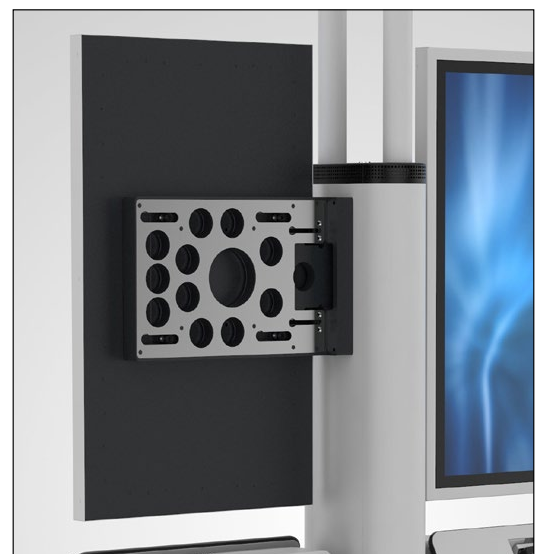
Screen attachment by holders with snap fasteners