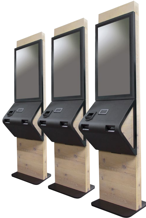
Figure shows configuration variant